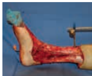
Trauma – degloving