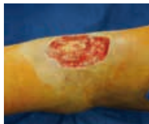
Mixed chronic ulcer