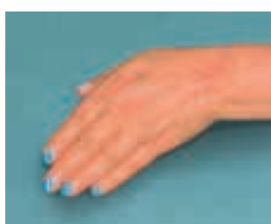
1 year post-operative