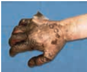
3 rd degree burn