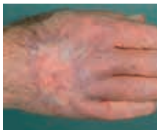
6 months post-operative