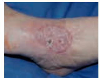
2 weeks post-operative