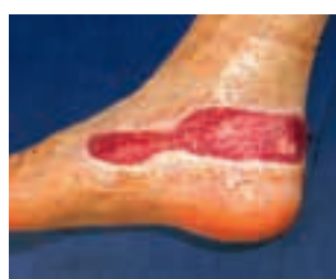
Trauma – avulsion